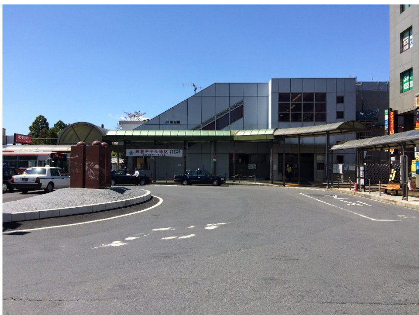
Seta Station South Entrance