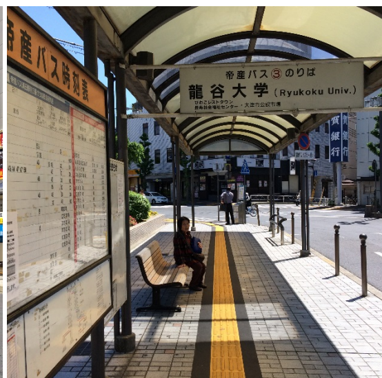
Bus Stop (3) For Ryukoku Univ.